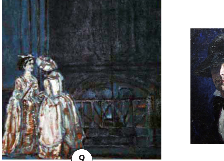
1. SÉRAPHINE PICK [b. 1964 New Zealand] He (Disappeared into Silence) 2004 oil on canvas